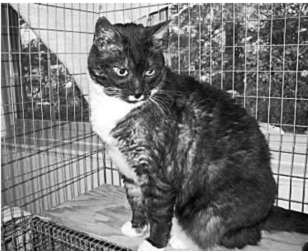
Smokey loves everyone