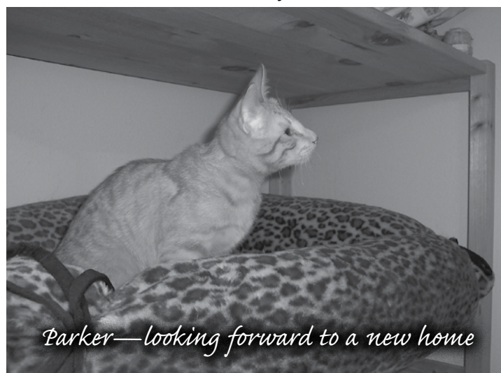
Parker—looking forward to a new home

Often we see cats slinking away from us beneath cars in parking lots, or under shrubs in parks or apartment complexes. Where might this poor cat's next meal come from? Did you ever stop to consider it's plight? Whether they are lost, abandoned, sick, or injured—each cat has a story. Feral Cat Foundation members always consider these possibilities when encountering an unknown cat. With your support, we can help where help is needed. With your assistance, we can give hope to the forgotten felines we care for daily. Please send your tax-deductible donation in the enclosed envelope TODAY! The cats and kittens really need your help.