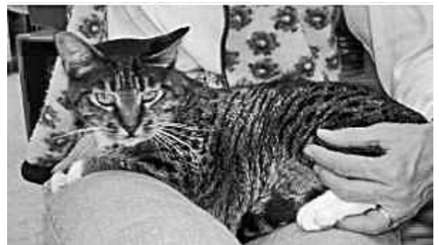
Shirley Ann loves to be carried around, and accepts friends well.