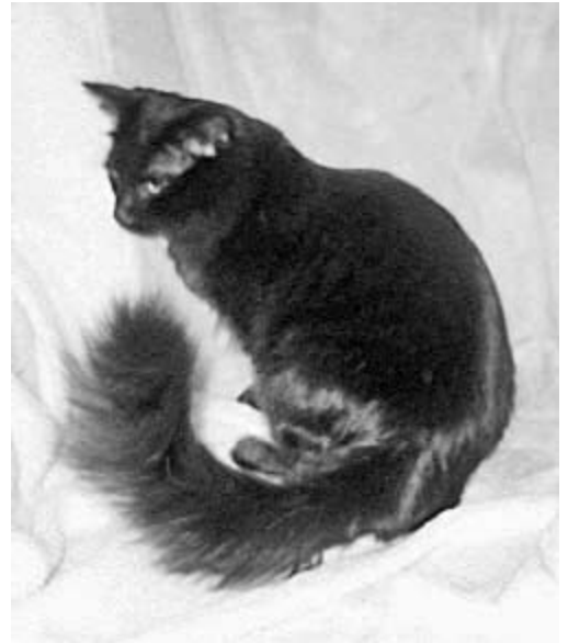
Henry—a gentle soul looking for love

We hope for peace and love to warm hearts around the world.